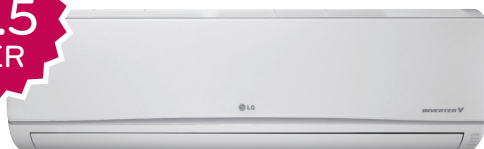
Standard High Efficiency Wall-Mounted Indoor Units