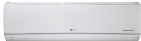
Multi F Standard High Efficiency Wall-Mounted Indoor Units