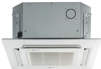
Multi F Ceiling Cassette Indoor Units