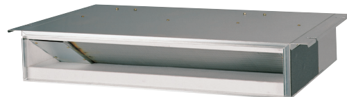
Multi F Ceiling Concealed Ducted Indoor Units