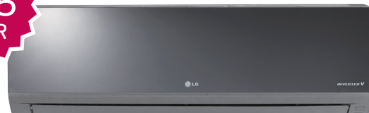
Art Cool™ Mirror High Efficiency Wall-Mounted Indoor Units