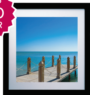
Art Cool™ Gallery Inverter Indoor Units