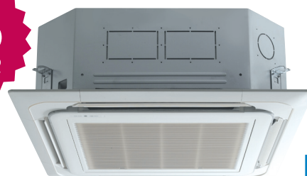
Ceiling Cassette Indoor Units