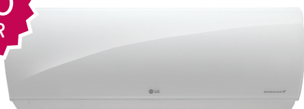
Art Cool™ Premier Supreme Efficiency Wall-Mounted Indoor Units