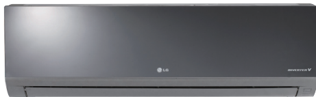
Multi F Art Cool™ Mirror Wall-Mounted Indoor Units

Select from a variety of sleek, elegant indoor units to complement any decor. And the choice is not limited to one type of indoor unit per system—mix and match according to function and style!