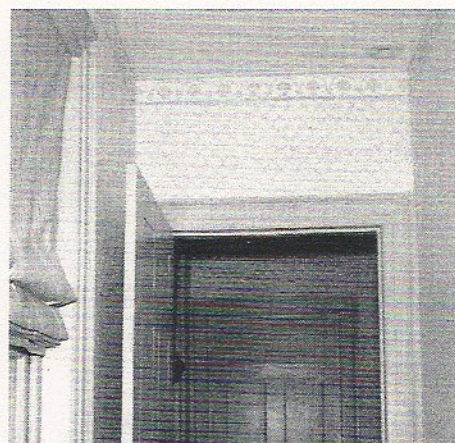
A Unico System outlet provides modern day comfort without marring the original aesthetics of the Daniel Wheaton Home, c. 1796

Tattersfield has been completely satisfied with the performance of the Unico System, as well as its ability to preserve the integrity of the historic home. In fact, she is hoping to have a Unico System installed in the first floor some time in the future – a retrofit solution that Tattersfield clearly finds great comfort in.